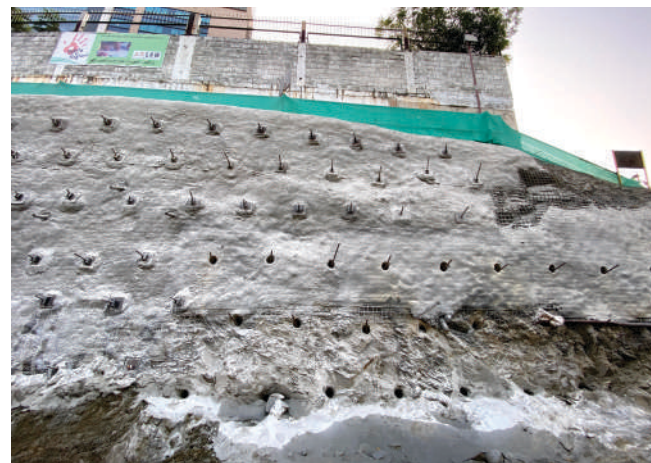
Soil & Rock Anchoring