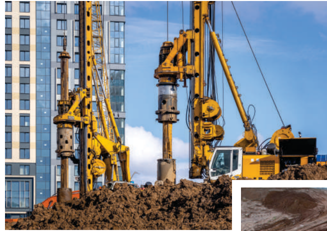
Bored Cast In-situ Piling